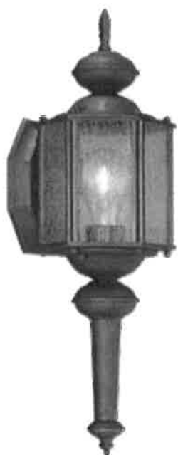
Front Door Light Fixture