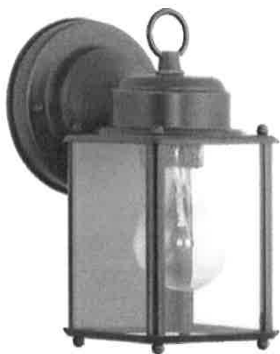
Rear Door Light Fixture